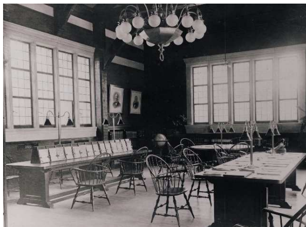
The interior of the Old Library, circa 1910.

A report on the Old Library was presented at the Selectmen's Meeting of Jan 27. The Selectmen are currently receiving detailed reports on the condition of the Old Library from the JST/OL Committee and the Permanent Building Committee. A detailed report is accessible on Weston.org, at http://weston.govoffice.com/index.asp?Type=B_BA_SIC&SEC={F689D95C-36E9-4ADA-9616-E34BF56AA775}&DE={F99FCF85-2FB7-4703-A8B5-AFAA99F50586}